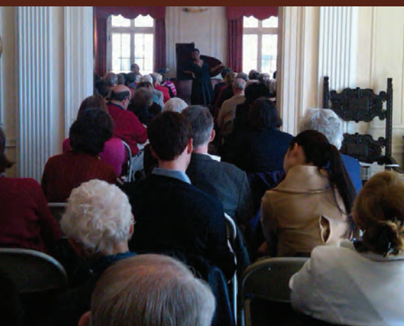
A sold-out Merestead concert