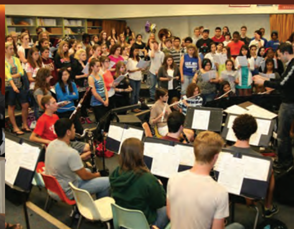
Copland House in the schools